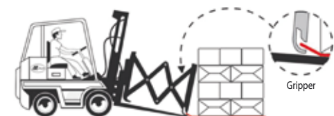
1. Extend the pusher plate so that the slipsheet lip fits into the gripper channel opening