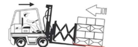
2. Retract the pusher plate. The gripper bar will automatically clamp the slipsheet lip